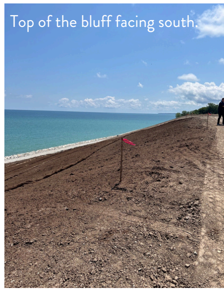
Top of the bluff facing south.

COUNCIL AWARDS FIRE STATION #3 PARKING LOT REHAB CONTRACT Council awarded the Fire Station #3 Parking Lot Rehabilitation contract to LaLonde Contractors, Inc. at the estimated cost of $145,416.76. Beginning in September, the project will replace the asphalt lot with pavement. The project is estimated to be complete in October. COUNCIL ADOPTS RESOLUTION TO ACCEPT AFG FUNDING The Fire Department was awarded an Assistance to Firefighter's Grant , allowing the Department to purchase 27 units of essential self-contained breathing apparatuses (SCBA). The Department will be purchasing an additional 9 replacement SCBA.