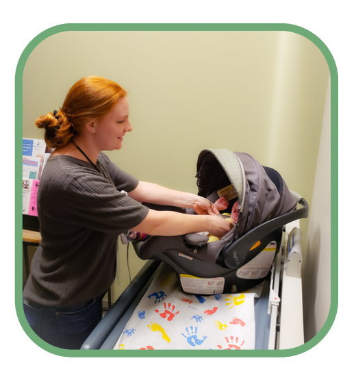
Car seat check