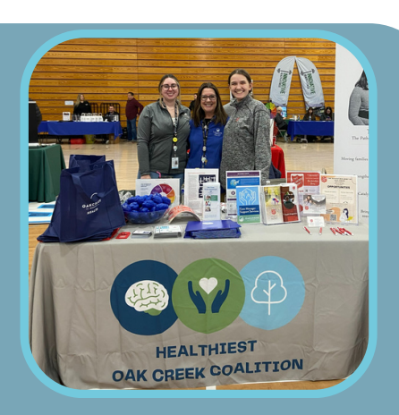
Coalition table at event