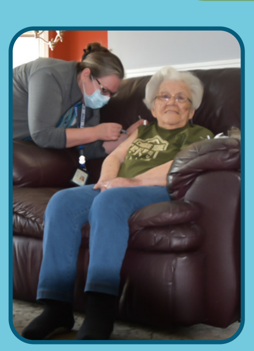
Public Health Nurse administering vaccine on a home visit