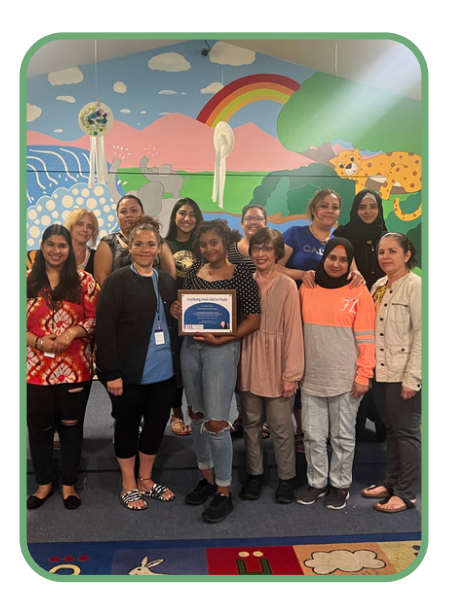
Breastfeeding Friendly Workplace Certificate for Creative Explorers Learning Center