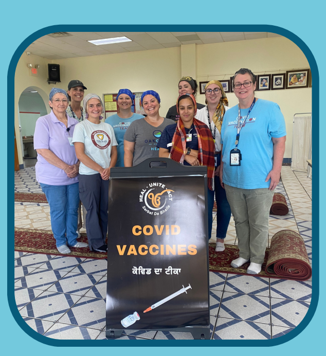
Community vaccine clinic at Sikh Temple in Oak Creek