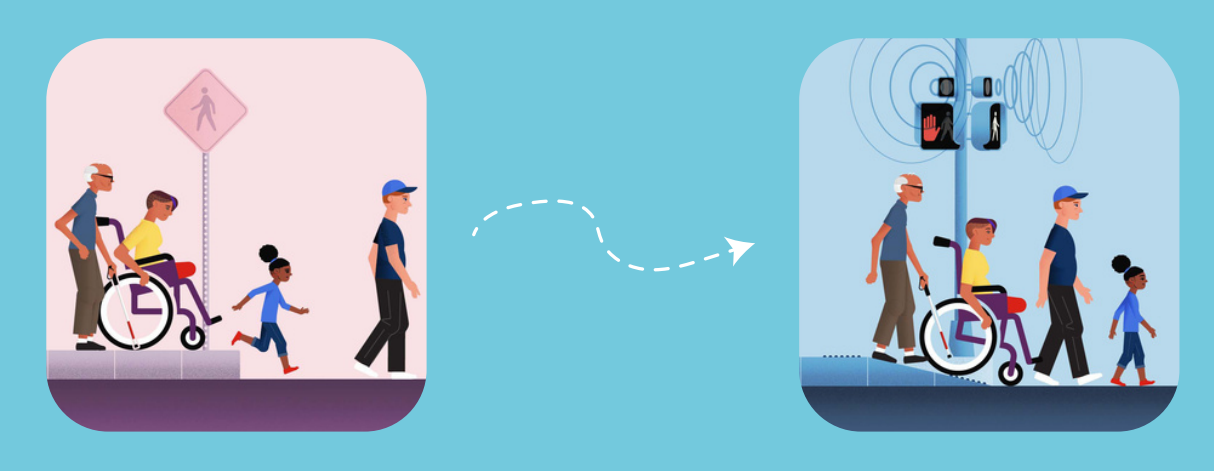
Equality Everyone gets the same - regardless of if it is needed or right for them

The Health Department is committed to centering our work around health equity and acknowledges that doing so is vital to promoting and ensuring the health of our entire community. A wide variety of disparities or variation in age, race, income, sexual orientation, gender, culture, language, and religion can present barriers to achieving health and accessing needed services and providers. Our determination to address these disparities and promote equity deeply drive and motivate our commitment to improving health throughout our community.