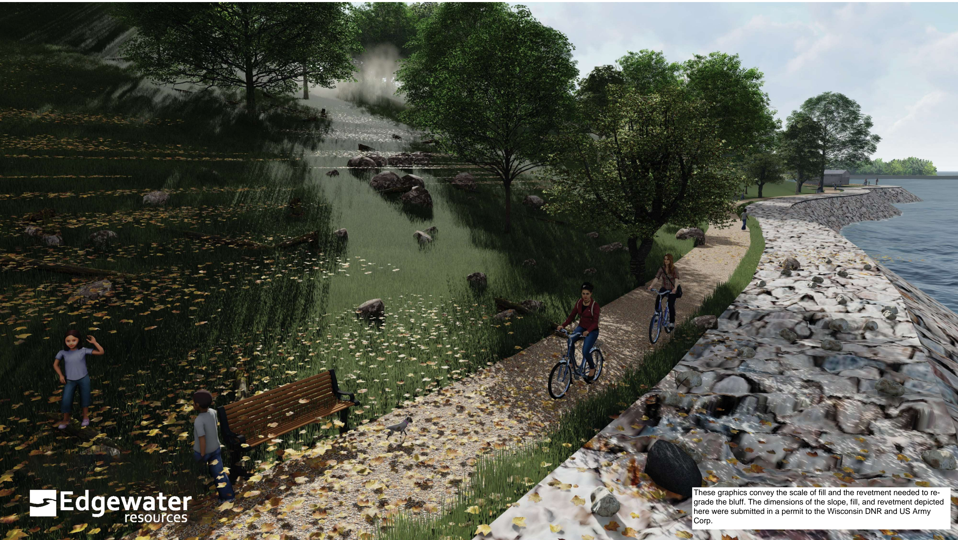
These graphics convey the scale of fill and the revetment needed to re-grade the bluff. The dimensions of the slope, fill, and revetment depicted here were submitted in a permit to the Wisconsin DNR and US Army Corp.