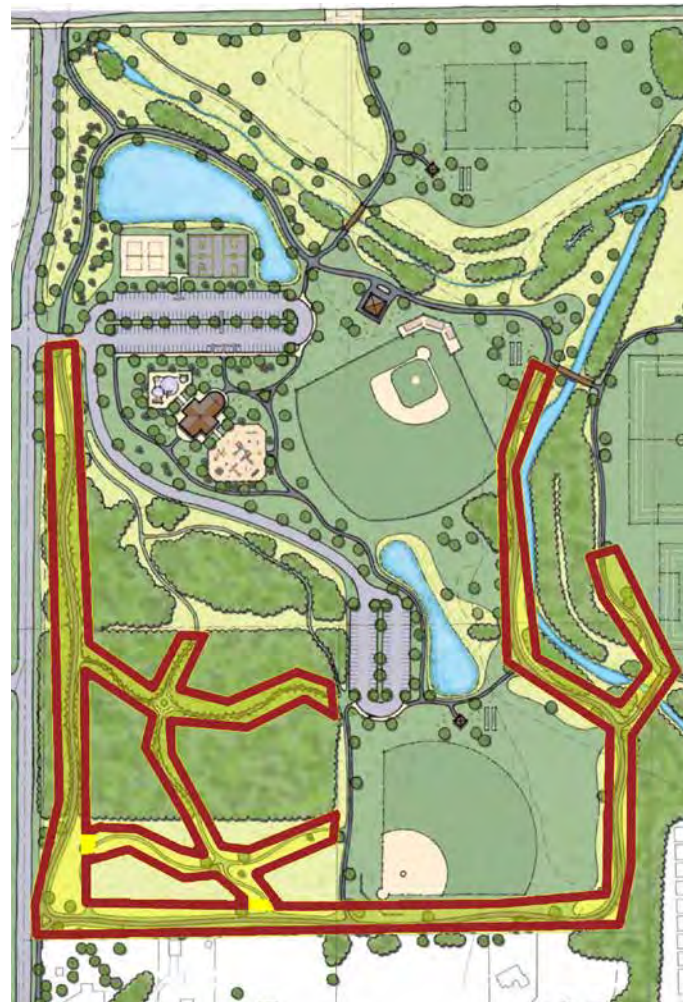
On the Cover: The Dale Richards Trail, inside of Emerald Preserve Park.

The City intends to update the master plan for Abendschein Park in 2017. Once the plan update is complete, the City will determine future park development. Follow our City Facebook page and our web page for future updates to the park.